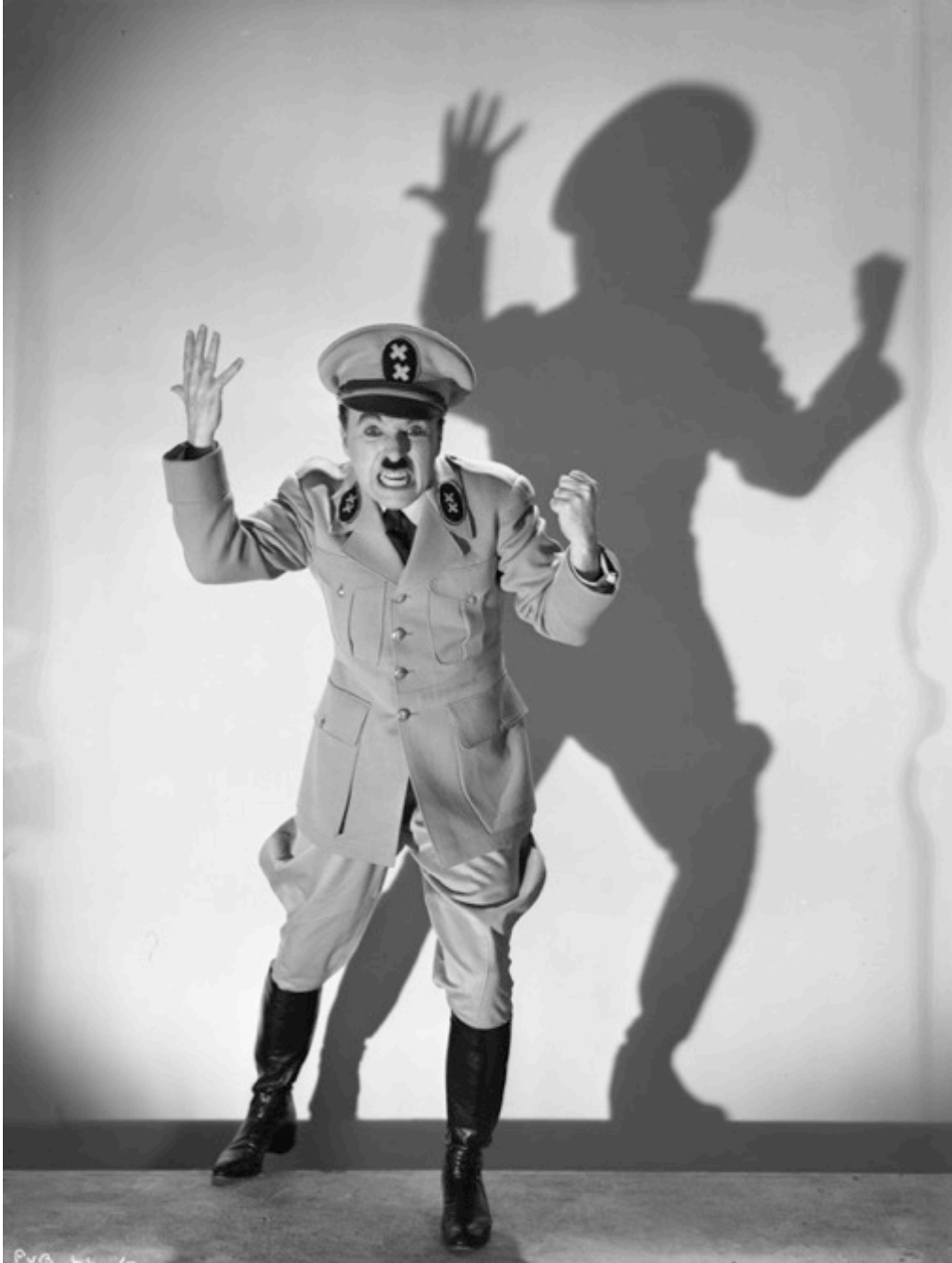
The Great Dictator (United Artists), 1939-1940.