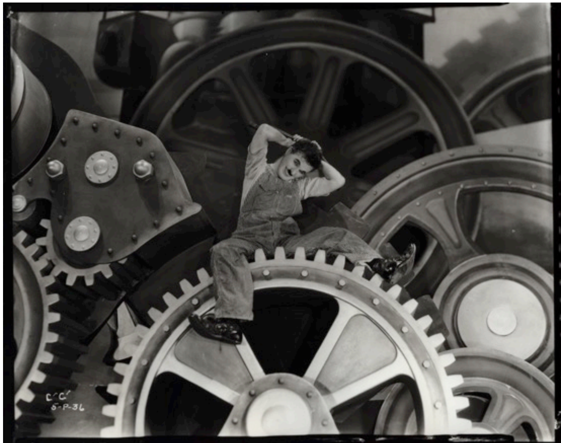
Modern Times (United Artists), 1934-1935.

(April 2018, Shanghai) Yuz Museum recently announced that they would bring a major retrospective exhibition of the King of Comedy, Charlie Chaplin, to China, coproduced by the Musée de l’Elysée, Lausanne and Yuz Museum, Shanghai.