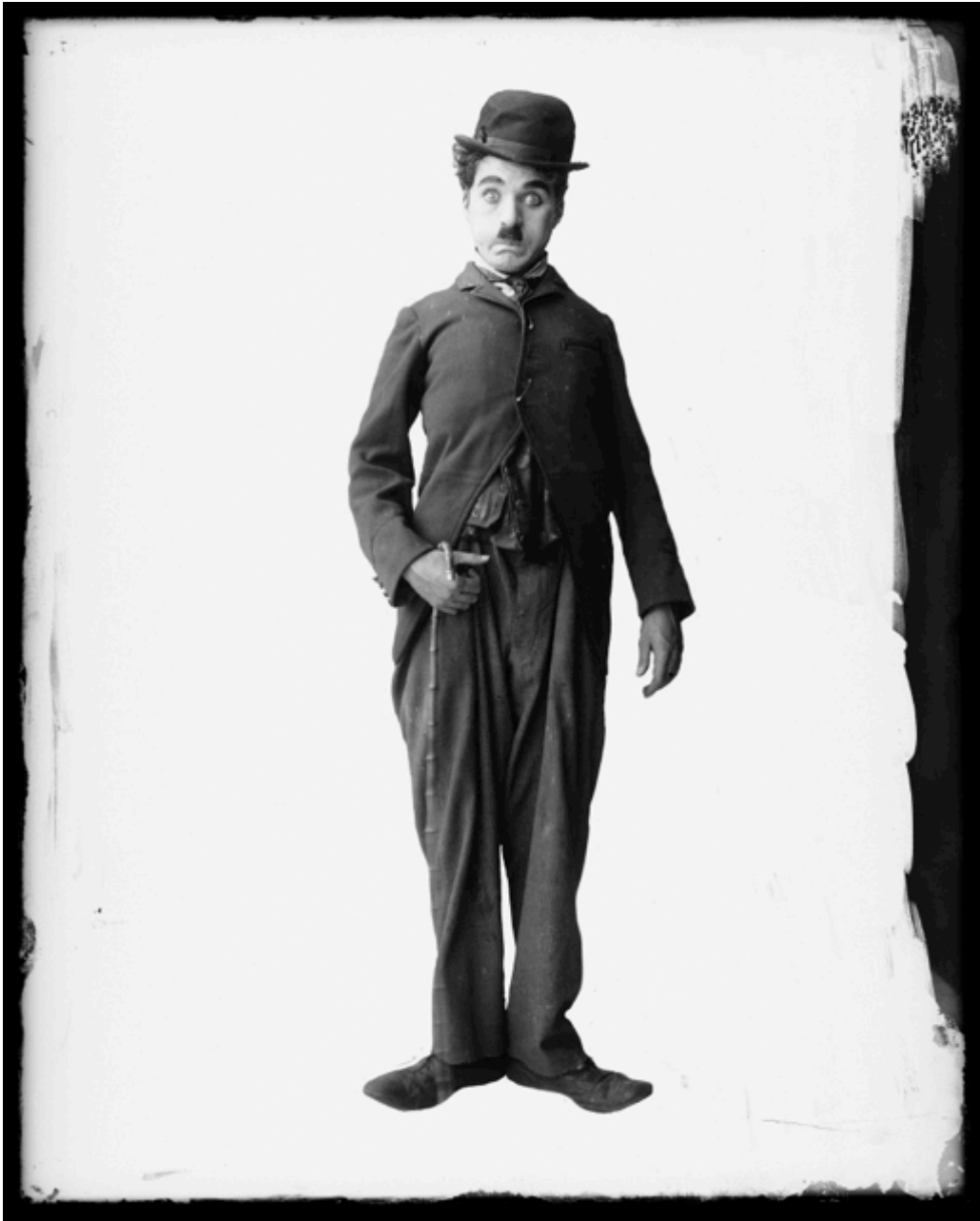
Charles Chaplin poses as the Tramp, circa 1915