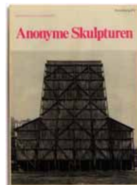
Anonyme Skulpturen , Kunst Zeitung n°2. Cover. Verlag Michelpresse, Düsseldorf, January 1969.

Since the late 1950s, the photographic work of Bernd and Hilla Becher has been dedicated to industrial landscapes and buildings, including factories, water towers, blast furnaces, head frames, coal silos, etc., usually abandoned. Their approach can be described as scientific in the sense that their images are filed and archived according to their geographical locations or their functionality. This industrial architecture photographed in the same neutral light and according to the same parameters appears as sculpture removed from its context.