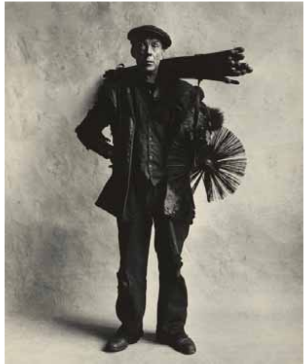
Irving Penn, Chimney Sweep , London, 1950