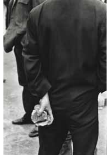
Anti-Catholic demonstration by the Orange order. Londonderry, Northern Ireland, August 1969.

The Musée de l'Élysée is proud to welcome into its collection 150 prints by the French photographer Gilles Caron. Donated by the Gilles Caron Foundation based in Geneva, this collection reflects the international events of the late sixties: Six Day War (Israel, 1967), Vietnam War (1967), May 68 in Paris, Biafra (Nigeria, 1968), Prague (Czechoslovakia, 1969) and the troubles in Northern Ireland (1969). The photojournalist carried out these series for the Gamma news agency which he co-founded notably with Raymond Depardon. Of the prints offered to the Musée de l'Élysée, some are reproduced in a single copy made from press contact sheets and negatives filed and preserved at the Gilles Caron Foundation. To mark this event, some of these prints and documentary films will be screened continuously in the Salle Lumières at the Musée de l'Élysée.