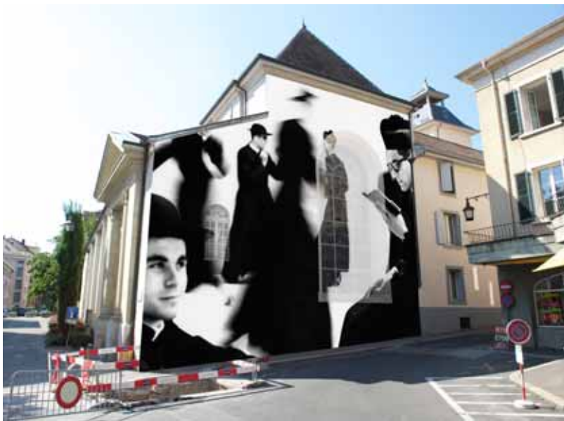
Photomontage.

French artist, JR has undertaken projects for monumental urban performances. In 2007, Face2Face illegally presented huge portraits of Israelis and Palestinians on both sides of the separation wall / security fence in Jerusalem. In 2008, he joined an international trip for Women Are Heroes , a project in which he emphasized the dignity of women. In 2010, the eponymous feature film competed for the Caméra d'Or at Cannes. JR has notably exhibited his work in Paris, London, Amsterdam, Arles, Berlin, Los Angeles and New York.