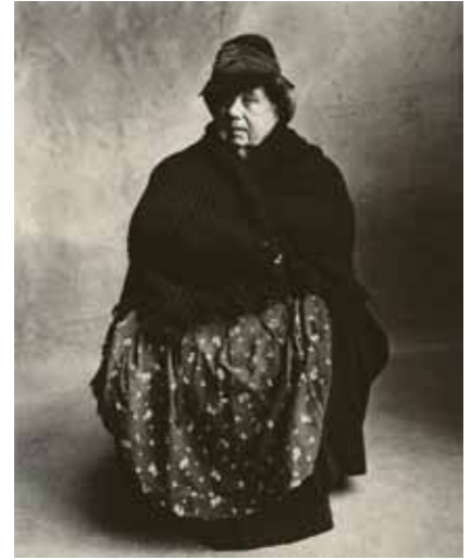
Irving Penn, Vehicle Watcher, London, 1950

For over sixty years, Irving Penn (1917-2009) made his mark on the history of photography with his fashion images, still lifes and portraits. A photographer for Vogue , Penn undertook a series of photographs called Small Trades in the early 1950s. Recruited from the streets of Paris, London and New York, sellers, news vendors, rag and bone men and chimney sweeps posed in their work clothes for the New York photographer who was convinced that many of these trades would soon disappear. Sent to Paris by Vogue in June 1950 to cover his first haute-couture collections, Penn took this opportunity to undertake this personal project based on his admiration for these small trades, so undisputedly associated with the image of the city.